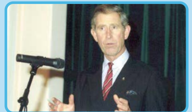
TAMESIDE AT 50 - PAGES 16 & 17 -

READ ONLINE OR PICK UP A COPY LOCALLY FROM ONE OF OUR COMMUNITY PARTNERS