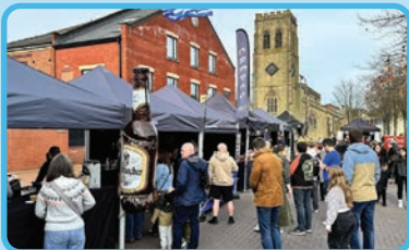
STREETFEST SUCCESS - PAGE 3 -